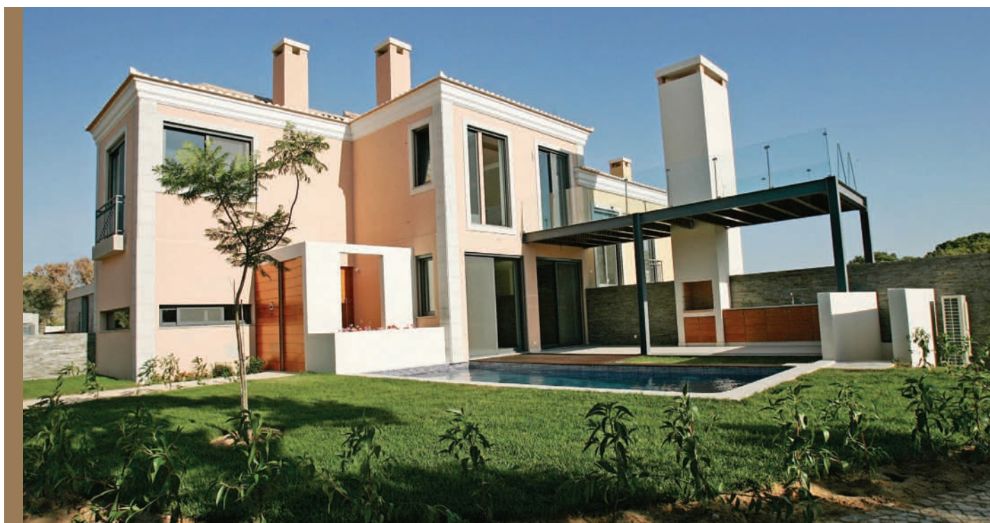
Royal Golf Development

An exclusive development designed for the discerning client - located along the 12th hole of the stunning Royal Golf Course - with clusters of two- and three-bedroom townhouses (Royal Golf Villas) and two- and three- bedroom apartments (Margarida Apartments). Diverse designs are available, adapted for a wide range of requirements and budgets. Traditional architecture and contemporary lines have been combined, with features such as stone-clad walls and exposed timber ceiling trusses cleverly incorporated with glass, stainless steel and wood panelling. Decked terraces, barbecue areas, overflow plunge pools and/or terrace Jacuzzis, multipurpose basements, and parking for cars and golf buggies are other highlights. Perfect for families and golfers alike.